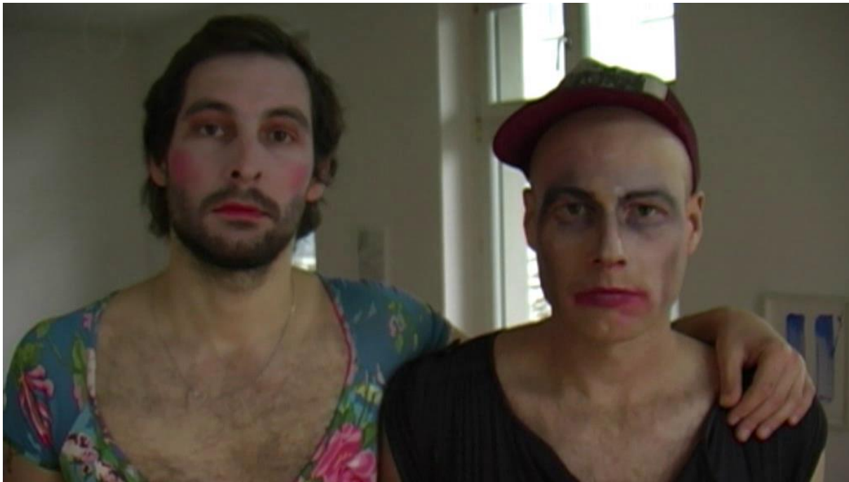
stills from Beaver , 2016 video, 26 min, edition of 5 + 2